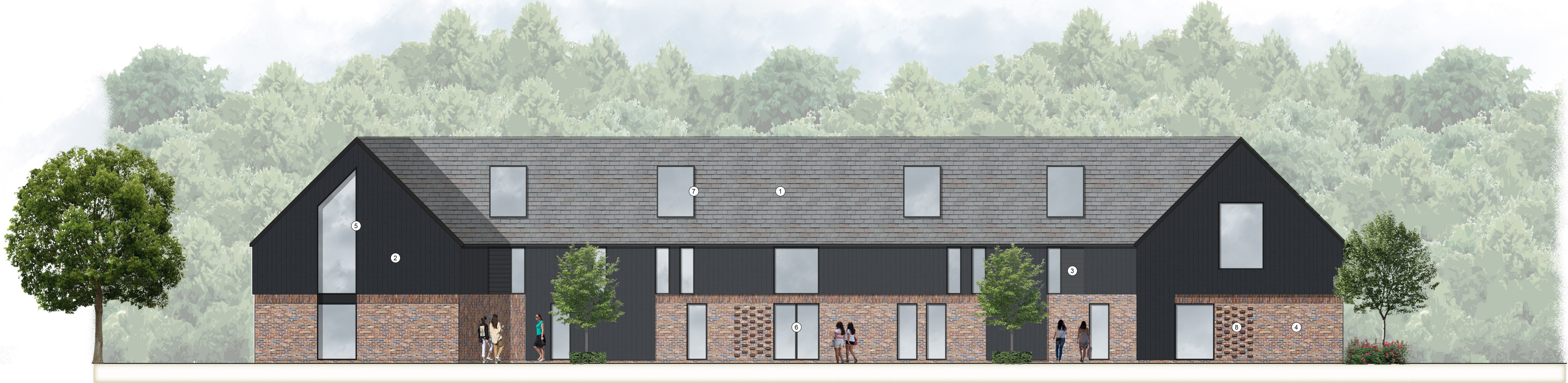
Gable end wing on western projection Entrance door to central block Gable end wing on eastern projection Block A - South facing elevation