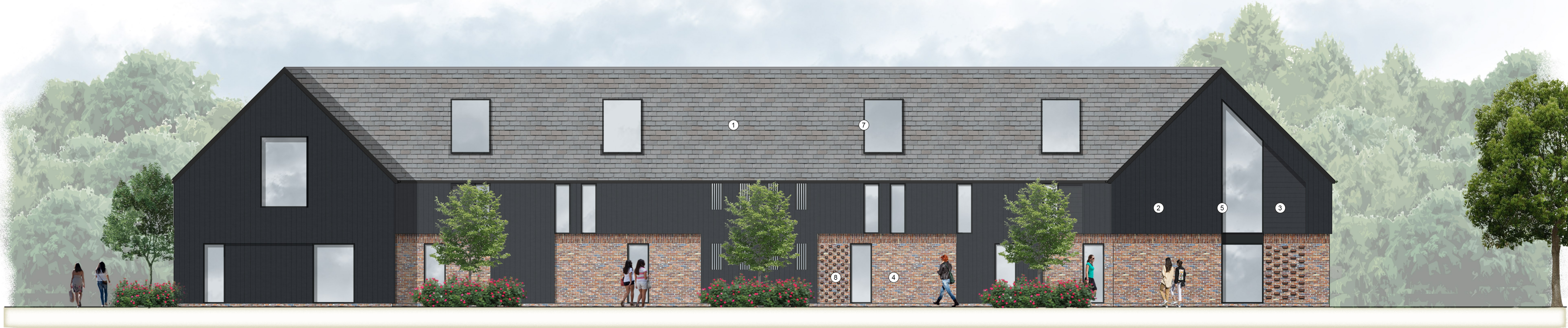
Gable end wing on eastern projection Gable end wing on western projection Block A - North facing elevation